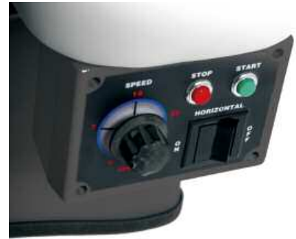
Shown in Cinder and Black

The Hill AFT is shown here with optional manual drops including Dual-Drop Cervical, Thoracic, Lumbar and Pelvic.