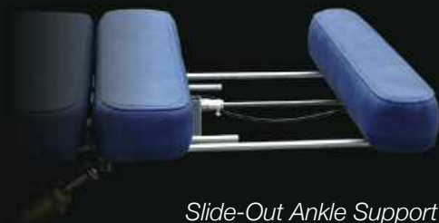
Slide-Out Ankle Support