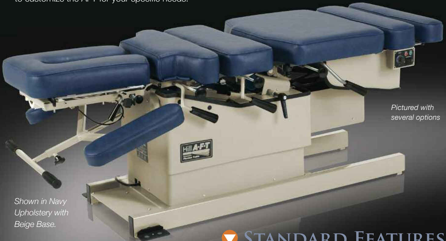
Pictured with several options

The Hill Automatic Flexion Table is perfect for doctors who want full-featured automatic flexion without the need for manual flexion. The AFT is surprisingly affordable for a table that features variable speed flexion, electric adjustable height and an impressive list of other standard features. Make the AFT even more versatile by adding up to four manual drops and several other options to customize the AFT for your specific needs.