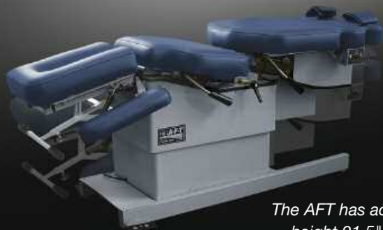
The AFT has adjustable height 21.5" to 29"